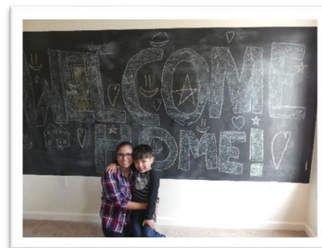
Volunteers decorated a chalkboard wall with a very special message.